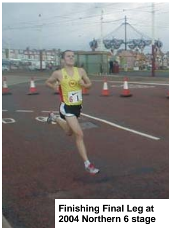
Finishing Final Leg at 2004 Northern 6 stage

On January 1 st I started training for my first marathon, the London Marathon on April 23 rd 2006. This would require more training than my persistent injury problems have allowed me to do in the last few years. However, high mileage weeks are not completely alien to me. As a student athlete at The University of Tulsa from 2001 –2003 I was able to run around 100 miles per week regularly. Then I was studying for no more than 15 hours per week and had daily access to free physiotherapy and massage. Now I'm working a 40 hour week and physiotherapy costs money. I'm no longer pampered like I was a few short years ago.