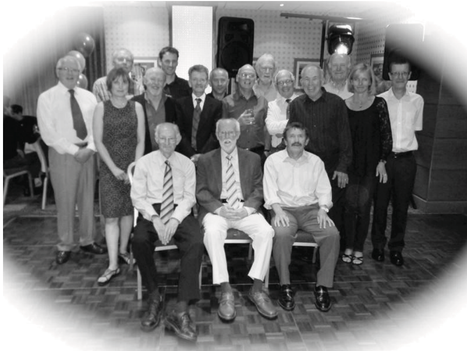
Some of the 39 members who have completed 25 years with the club