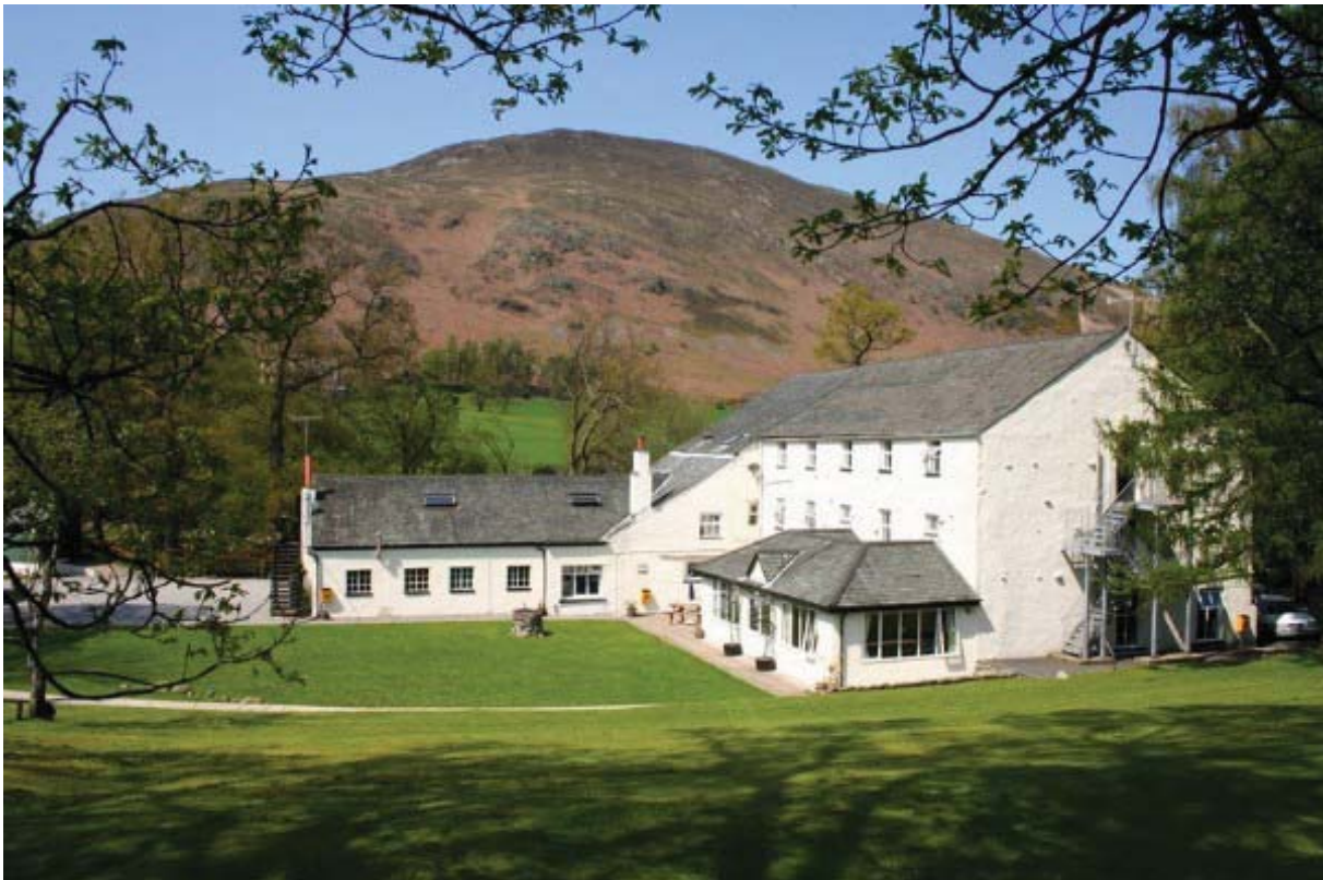
Newlands Adventure Centre

(This is also a week before the Fell Relays which are to be held in the Yorkshire Dales at Kettlewell.)